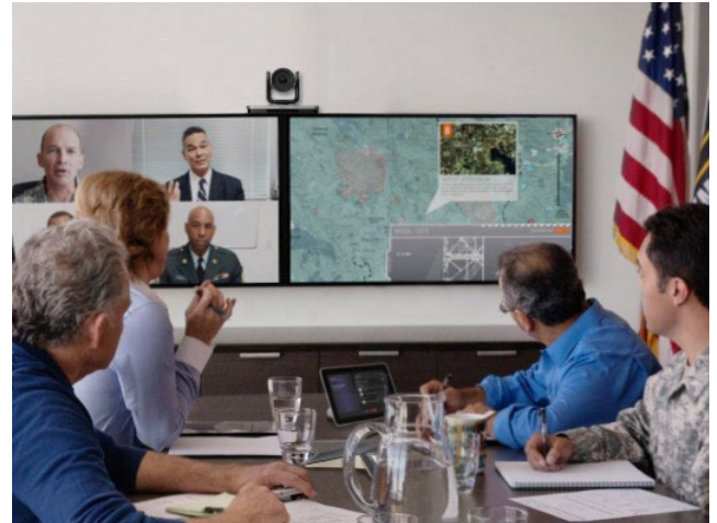
"Technology for Today's Collaborative Work Environment"

ABM Federal is committed to understanding and helping our government clients better navigate the ever-changing technology and cyber threat landscape. We provide objective intel and advice, reduce procurement friction, and leverage our technical knowledge and industry partnerships to deliver high-impact solutions and an overall experience that prioritizes security and performance.